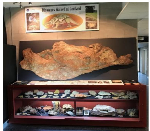
Exhibit image